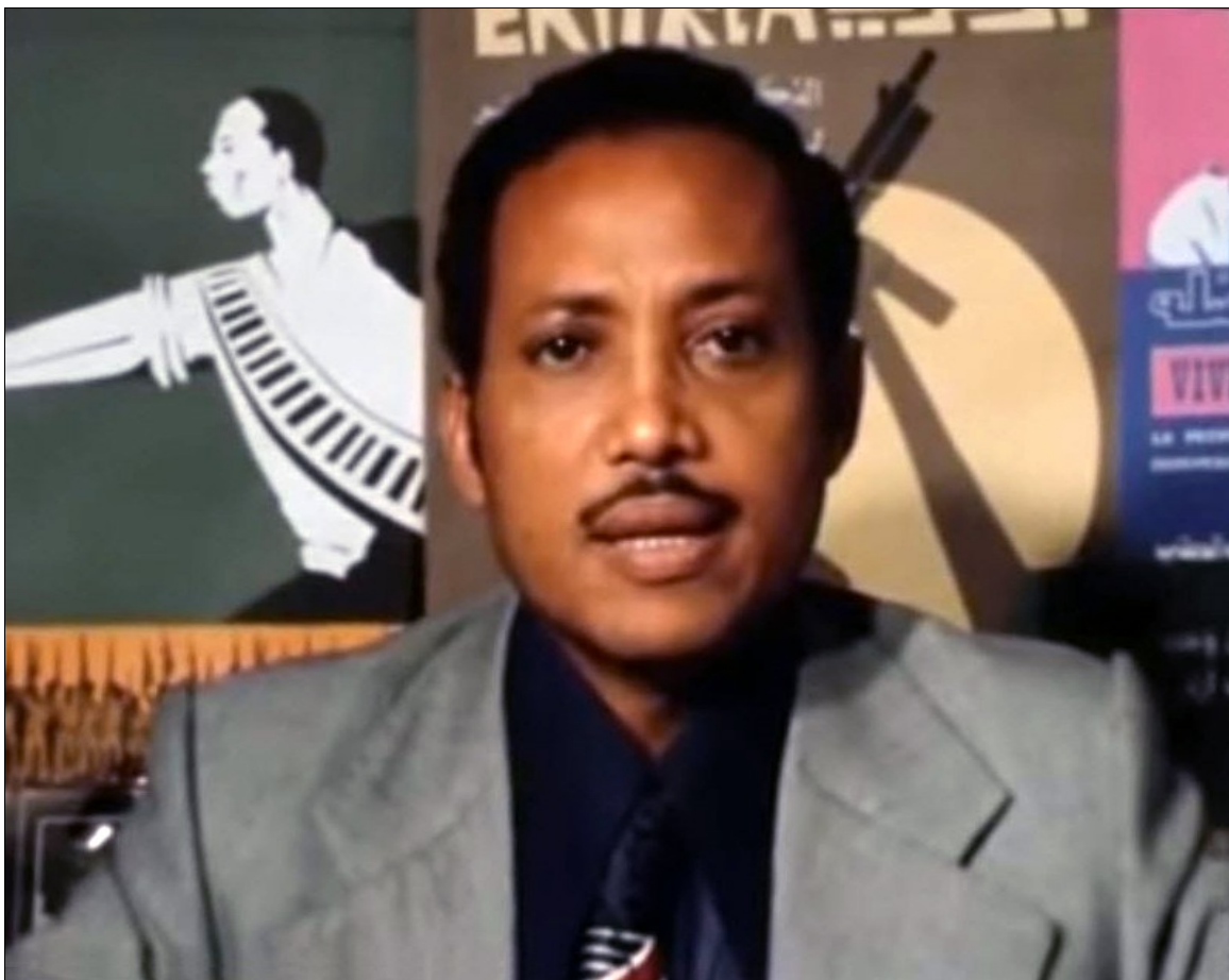
Right Honorable Osman Saleh Sabe of ELF-PLF was killed in a cold blood in a hospital of Cairo.

From 1977 to 1987 the blood bath intensified as the mass killing of all the radical elements and moderates took place secretly within the E.P.L.F. Horrible torture methodologies were introduced in the Halewa Sawra. No liberation movement in the world had ever silencers in its arsenal but the E.P.L.F.